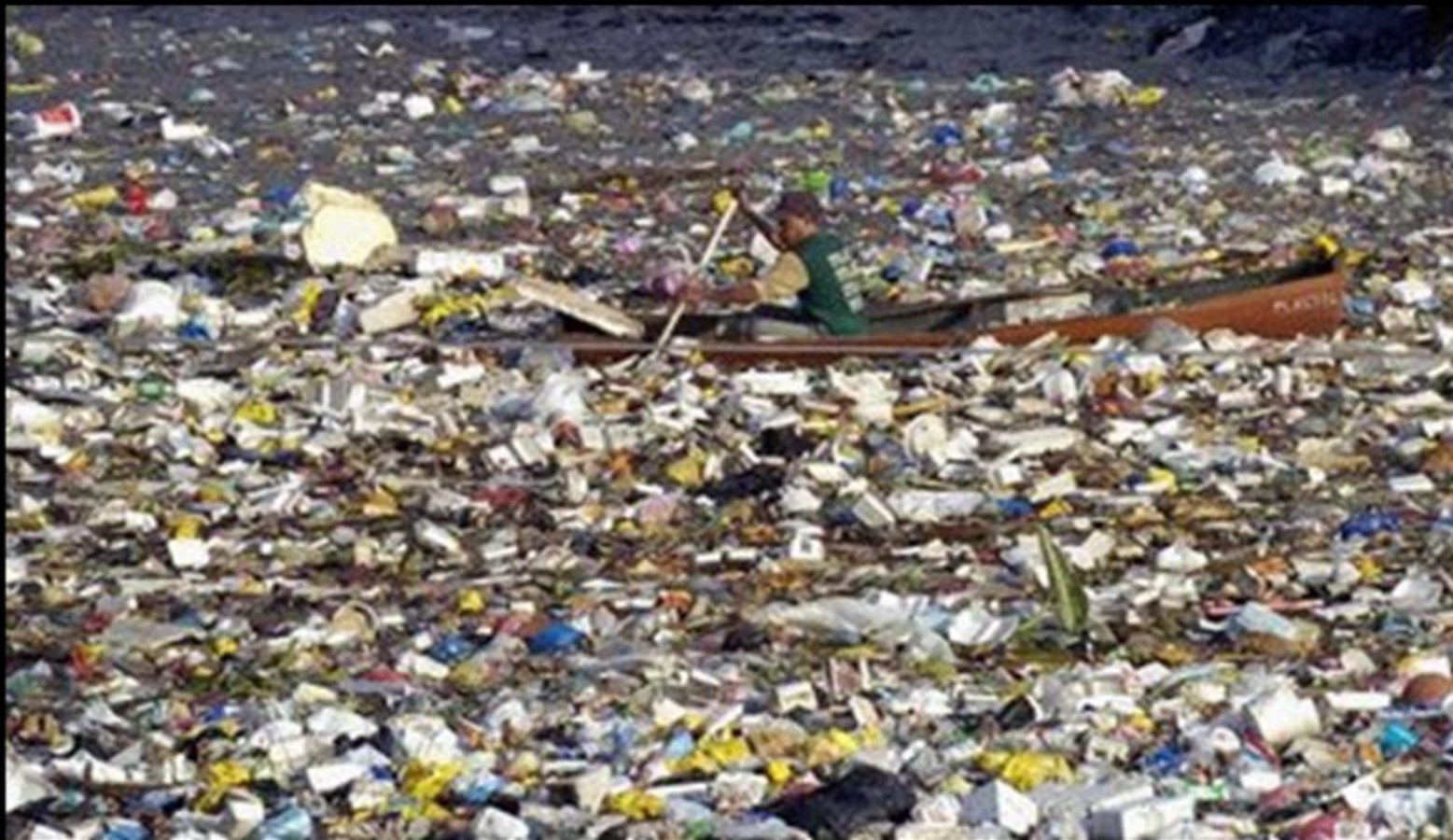
Photo of Pacific Ocean Year 2004